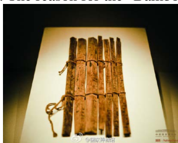
Figure 1: The Western Han Dynasty "Kangju Wang Herald Book" Wood Slip [7]