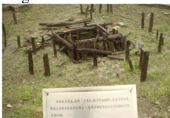
Figure 6: Hemudu Ancient Cultural Site Water Well

In the teaching process, teachers can use the multimedia technology such as ppt courseware to present cultural resources pictures or small videos. These cultural relics can be either cultural relics in museum collections or historical relics in the fields. For example, the wells and sacred characters can be used to present the Hemudu ancient cultural relics well (Fig. 6), so that students can understand the stiles in the stencils and ruins. Correspondence. On the other hand, you can also use the Internet+ to learn about the cultural relics related to the Chinese characters you learn through pre-class and post-class expansion through new media channels such as WeChat, Weibo, and Webcast. For example, after explaining the "Gold" of the "Mirror", students recognize that with the change of objective things in social development, some Chinese characters retain the historical information at the time, and the ideographic function is weakened in modern society. Teachers can search for such Chinese characters in Chinese characters, such as money, bowls, cups, etc., so that students can use the Internet platform to find cultural relics resources to explore the connection between Chinese characters and meaning.