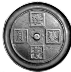
Figure 5 Song Yaotai Moon Mirror [9]

Another example is the use of literary literacy in the "increase in the days", in which "Gulang Yuexing" has "Yaotai Mirror", "Wang Dongting" has "No wind in the pool, mirror without Grinding", can show the Tang Dynasty Moon Palace bronze mirror (Figure 4 And the Song Dynasty Yaotai moon mirror (Figure 5), guide students to grasp the meaning of words and ancient poetry, while understanding the "Mirror" font next to the "Gold", "View" for the ancient bronze mirror, so there is "taking copper as a guide, can It is the crown of the garment; the ancients can be used as a guide, and it can be known that it is a substitute for others".