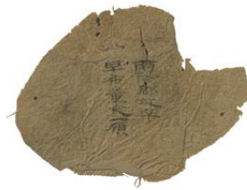
Figure 3 Han Dynasty Scripts Juyan Unearthed [8]