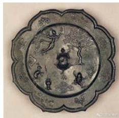
Figure 4 Tang Yuegong Bronze Mirror [7]