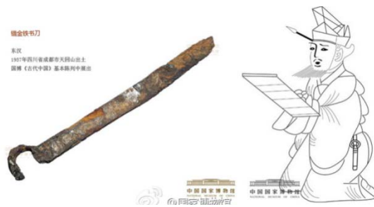
Figure 2: Bai Shou Han Ting Knife Pen [7]